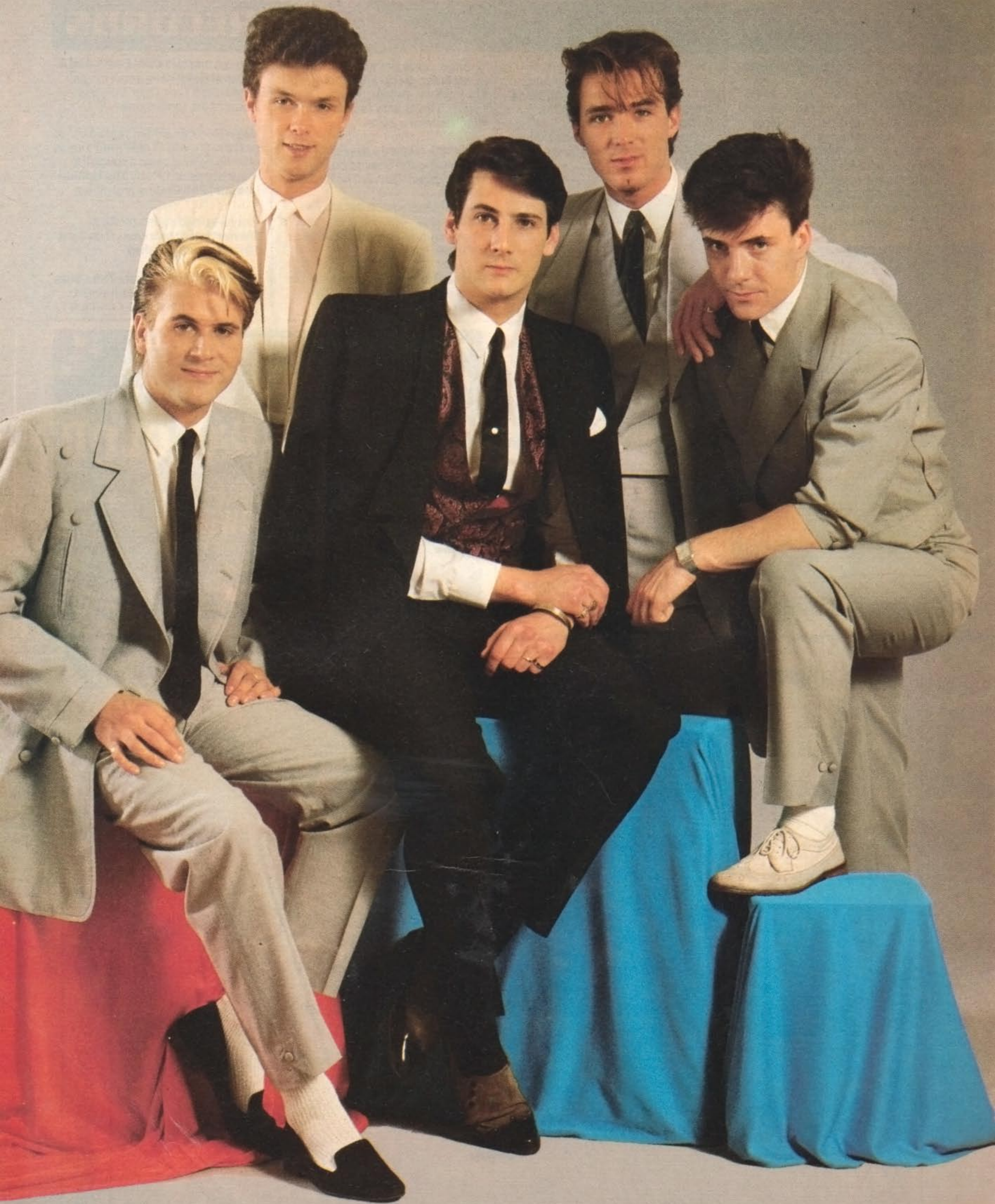
NO.1 SPANDAU BALLET