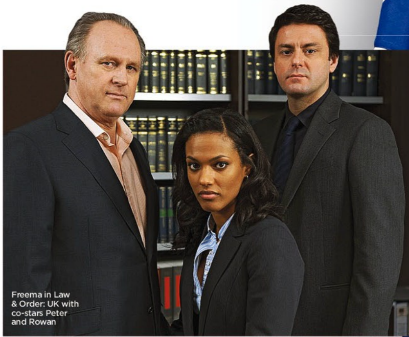
Freema in Law & Order: UK with co-stars Peter and Rowan

wasn't on my list of things to do before I die, but I was really chuffed about it. Martha sits on the dresser in my bedroom.