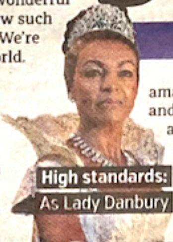
High standards: As Lady Danbury

amazingly handing out grants and you were overseen by an architect. I learned how to lay concrete floors, hang ceilings, do plastering and a bit of terrible bricklaying. I can do a