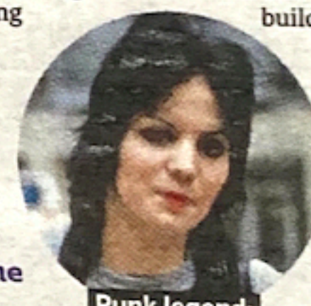
Punk legend: Joan Jett

Yes, if my house was on Château DIY you would be going, 'That's got to go.' I still have the trousers from my first ever job from April 1984. I have a cupboard called The Cupboard of Doom that nobody can go near because if you open the door you will not get the door shut again. I have to go through it because at some point I am going to die and my children are going to go, 'What the hell is that? Bin it!' My husband has strong feelings about all the junk. His tastes are very aesthetic and sparse, and mine are sort of Steptoe And Son, really.