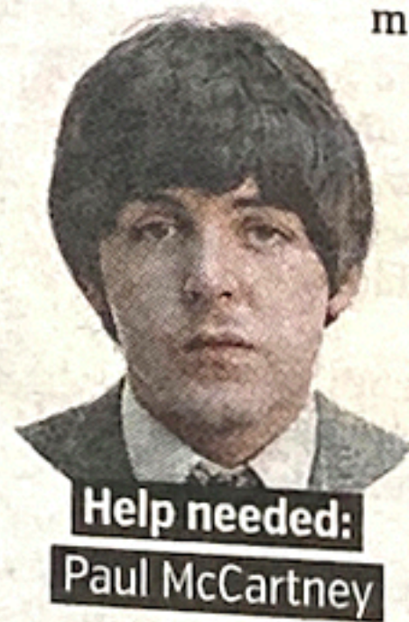
Help needed: Paul McCartney

The ice hadn't been broken. Elvis was watching TV and he sat back down and put his feet on the coffee table. Ringo was playing pool in the den. George had gone out to talk with one of the guys. John and Paul were just hovering over Elvis and nothing was said. Nothing. Elvis was watching the TV and then he said, 'Well, if you're not going to talk, I might as well go to bed.' That just