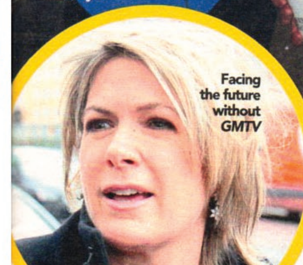
Facing the future without GMTV