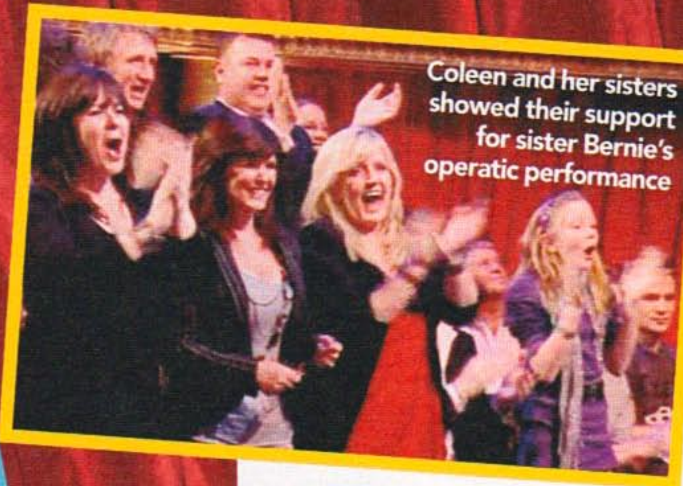
Coleen and her sisters showed their support for sister Bernie's operatic performance

you're judging ordinary people off the street. Look at poor Susan Boyle and her meltdowns. These people have had a normal life and then suddenly they're in the spotlight and being slagged off for the way they look. If you're not made of tough stuff, it could ruin your life.