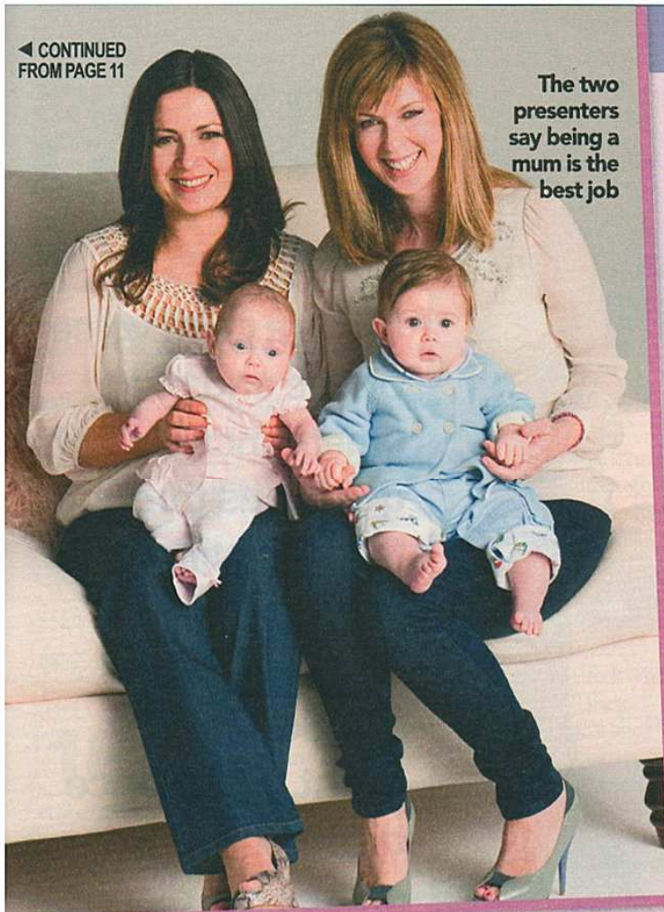
The two presenters say being a mum is the best job

oven that makes the house smell of home-cooking.