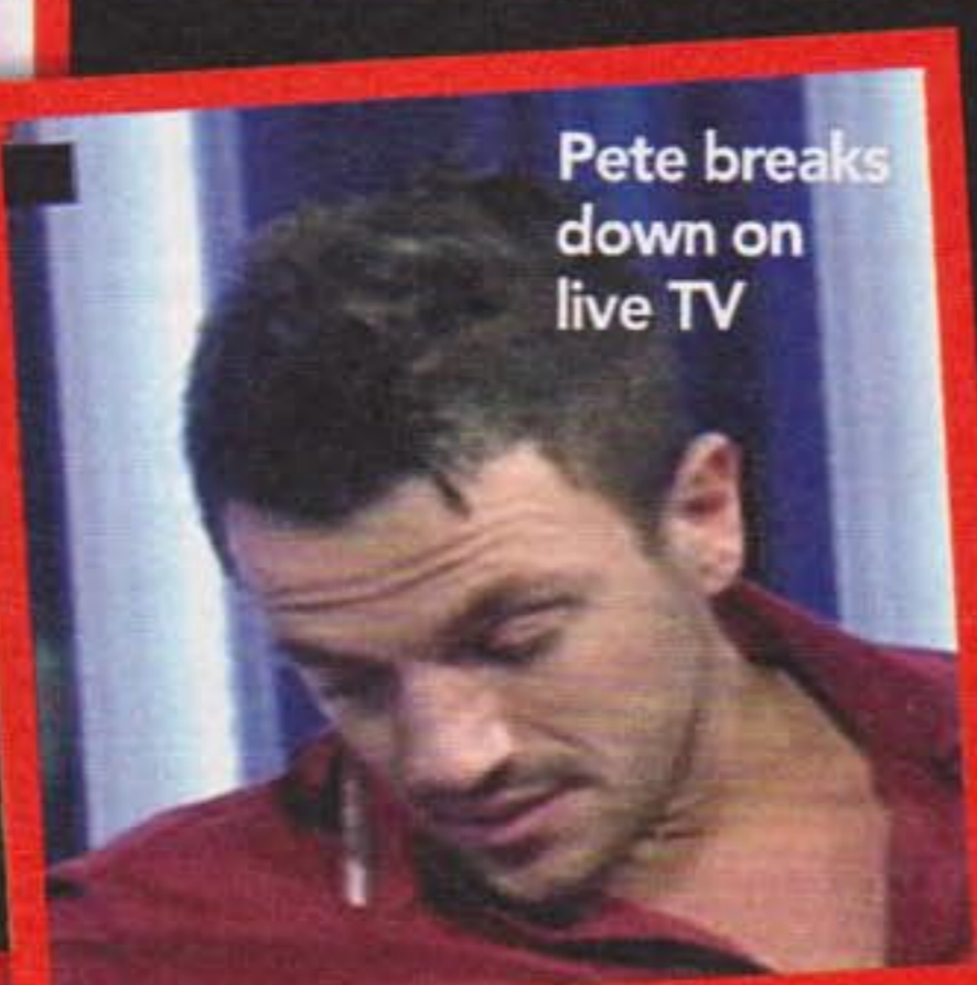
Pete breaks down on live TV