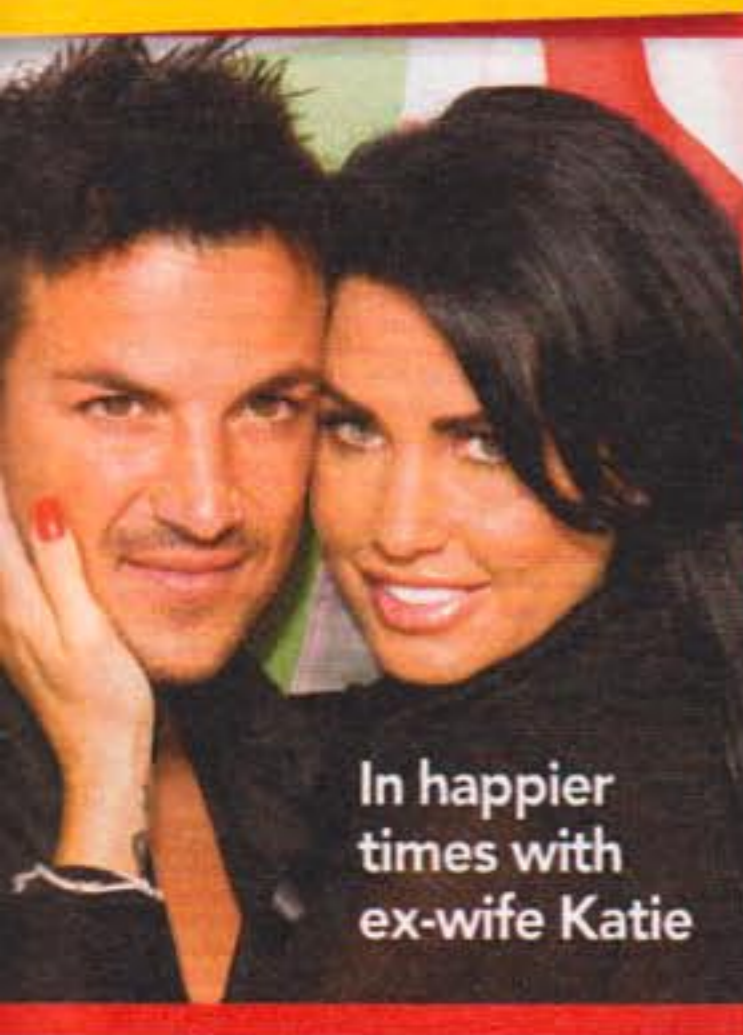
In happier times with ex-wife Katie