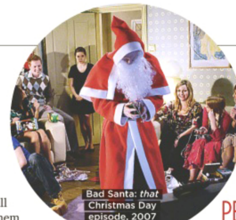
Bad Santa: that Christmas Day episode, 2007

It's somewhat surprising, given the pair's incredible success as a screen couple, that they were complete strangers before they