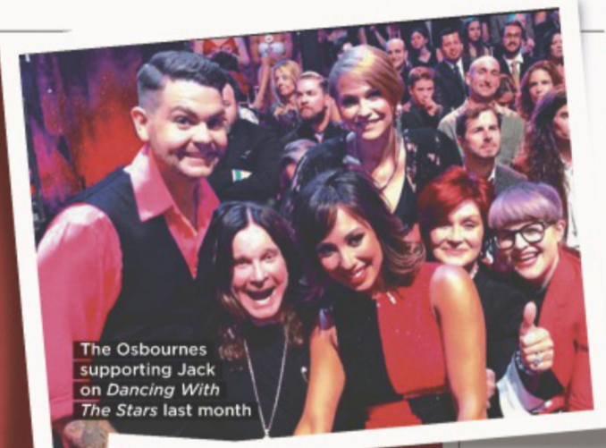
The Osbournes supporting Jack on Dancing With The Stars last month