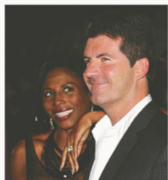
ON SINITTA REVEALING SHE WAS ONCE PREGNANT WITH SIMON COWELL'S BABY "She absolutely adores Simon – I think he's probably the love of her life. You can never say whether someone was right or wrong in that situation because love makes you do crazy things."