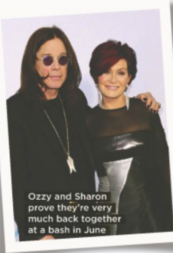
Ozzy and Sharon prove they're very much back together at a bash in June

mastectomy – Sharon is not about to let Ozzy completely off the hook. "I had to give it three months before I put my wedding ring back on," admits Sharon, who also sold Ozzy's £500,000 fleet of sports cars in 24 hours last year after one of his pub crawls. "You have to have these little milestones. I've told Ozzy: 'When you're sober for a year, you'll get a car again.' You have to work before you get it all back."