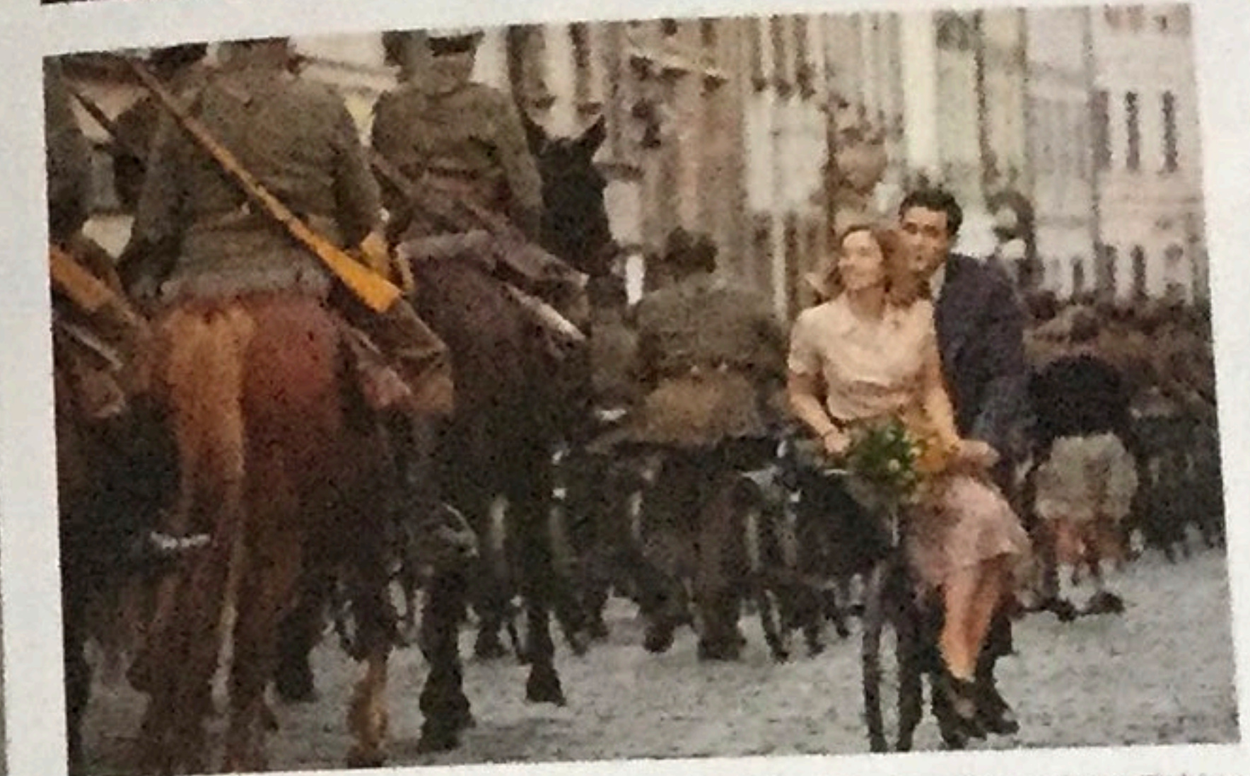
Clockwise from main: Keeping mum: Lesley Manville plays the snobby Robina who disapproves of her son's relationship; Sean Bean as pacifist Douglas; a bicycle made for two in Nazi-occupied Poland.

to make them land properly. As the series goes on and she starts to talk about feelings, there are some pretty great scenes between Jonah [Hauer-King, who plays her son] and I as well.